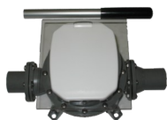
Top view of closed Trim Ring and Removable Handle