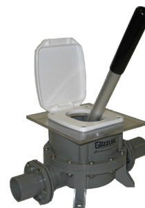
Pump shown mounted to plexi-glass plate with white trim ring visible above mounting surface

Duckbill — For dirty liquid and sewage. Permits mounting in any position.