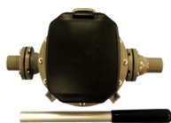
Top view of closed Trim Ring and Removable Handle