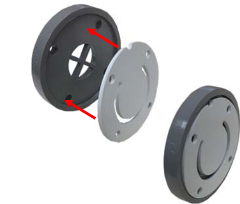
Flapper valve installed against flat-surface side of valve stop.